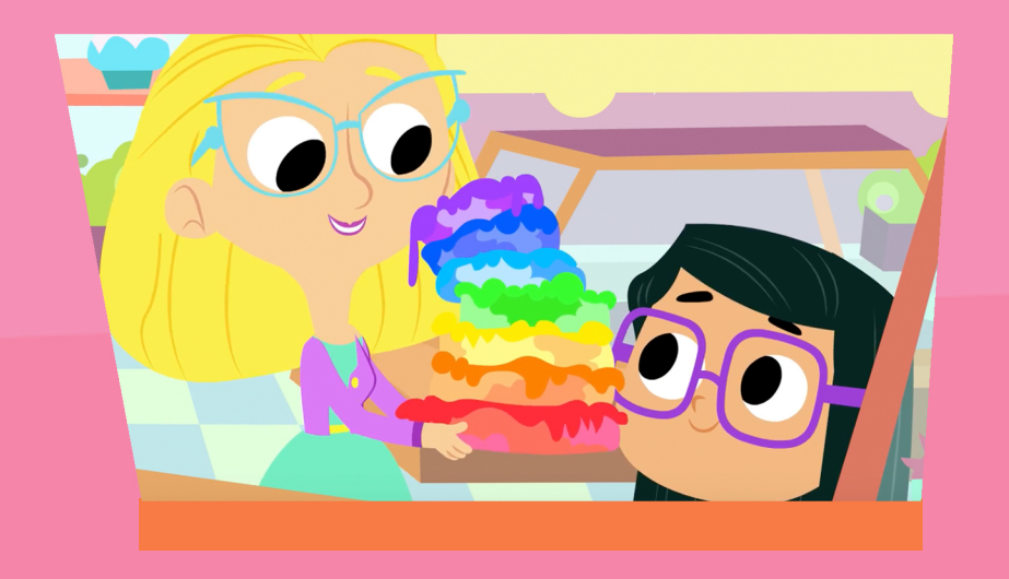
Episode 7 "Super Rainbow Macaron"

When Lili tries to help Bayani by making a fabulous kid-friendly macaron for his bakery, a disaster turns into an opportunity once they see the others' point of view.