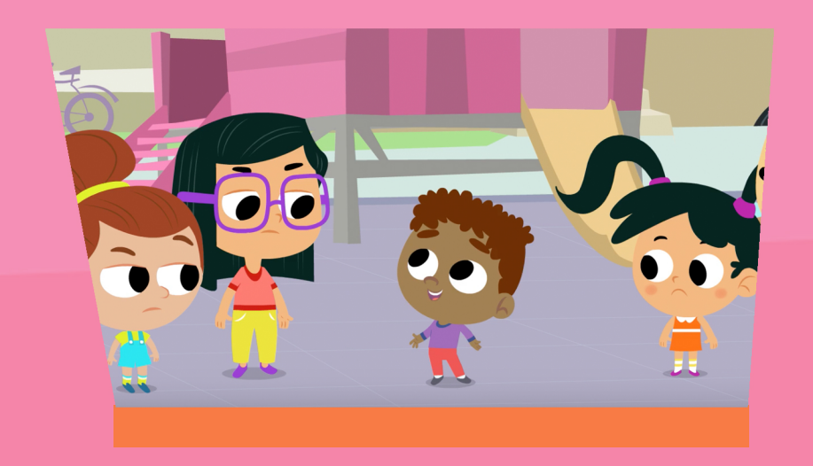
Episode 37 "My Pal Lionel"

Luc becomes jealous of Lola so he builds his own friend.